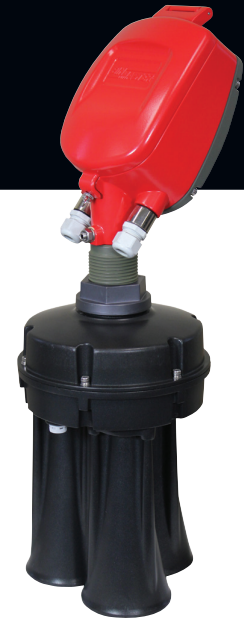
Teflon® Coated Transducer for Sticky Materials.

The Teflon coated antenna is designed for use in particularly difficult environments. Some examples of applications for the Teflon® coated antenna include soybean meal, which tends to be very sticky and can build up on a standard antenna. Flour and sugar are other clingy materials that can interfere with the performance of the antenna. Use of the Teflon® coated antenna also reduces the frequency for cleaning the antenna, prolonging the maintenance cycle.